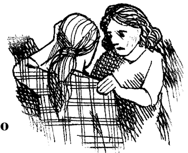
It may help to talk to a co-worker who is a friend.