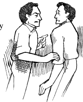
Sexual harassment may occur between members of the same sex.